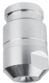
Twist and Dry ® (TD/TDK)

Two-fluid nozzles: These nozzles use two fluid streams, one for atomizing and the other for providing the necessary pressure. They are commonly used for highly viscous liquids and offer good control over droplet size. The XAER twin fluid nozzle is highly dependable for spraying liquids greater than 100 centipose.