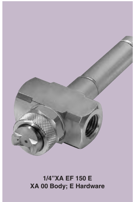
1/4" XA EF 150 E XA 00 Body; E Hardware