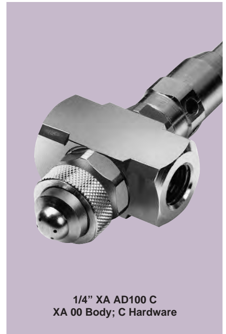
1/4" XA AD100 C XA 00 Body; C Hardware

Dimensions are approximate. Check with BETE for critical dimension applications.