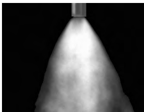
70° Hollow Cone