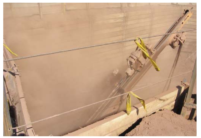
Example of dust build-up on a drill

when it is not practical to control dust preventatively. One example would be filling dump trucks from a pile with a loader. It is not practical to soak the pile such that the entire pile is damp, but a few well-placed nozzles around a filling point can reduce dust production significantly.