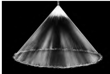
Hollow Cone 80° (H)