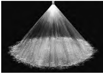
Full Cone 80° (F)