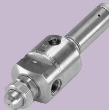
1/4" XA 02 PR050 E XA 02 Body; E Hardware

Dimensions are approximate. Check with BETE for critical dimension applications.