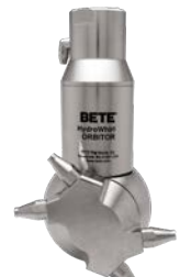
HydroWhirl® Orbitor Controlled Rotation Max. Range 130 ft/40 m

Note: The maximum cleaning range listed for each nozzle is equal to the tank diameter.