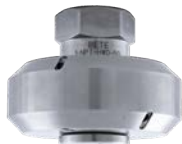
HydroWhirl® Disc Free-Spinning Max. Range 11 ft/3.6 m