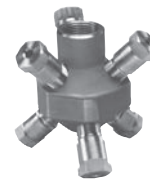
CLUMP Stationary Max. Range 10 ft/3 m