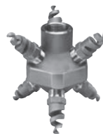
LEM Stationary Max. Range 8 ft/2.4 m