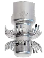
HydroClaw® Stationary Max. Range 10 ft/3 m